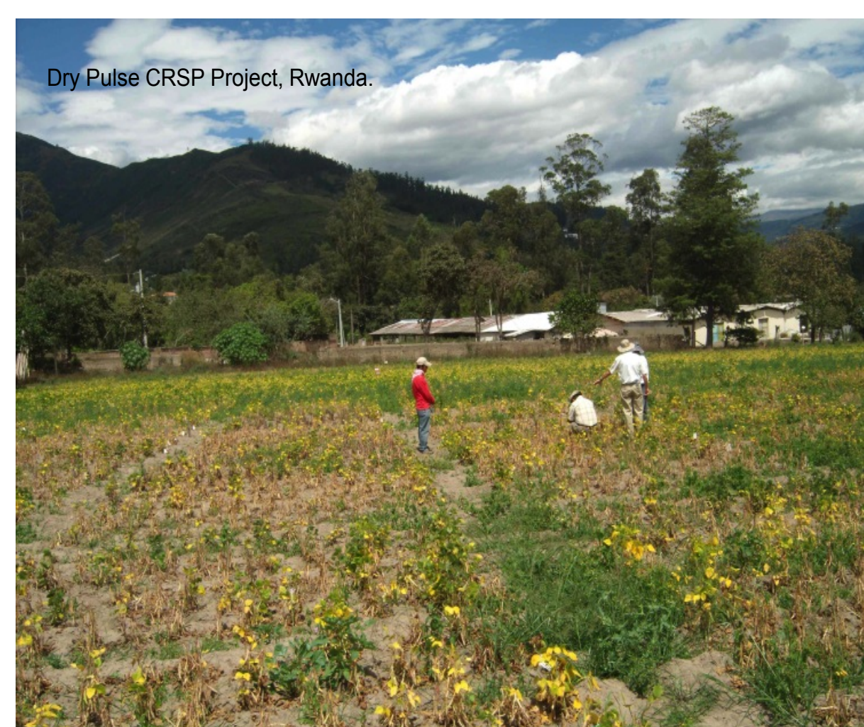
Fig. 1 Severe damage by Macrophomina to beans in Rwanda