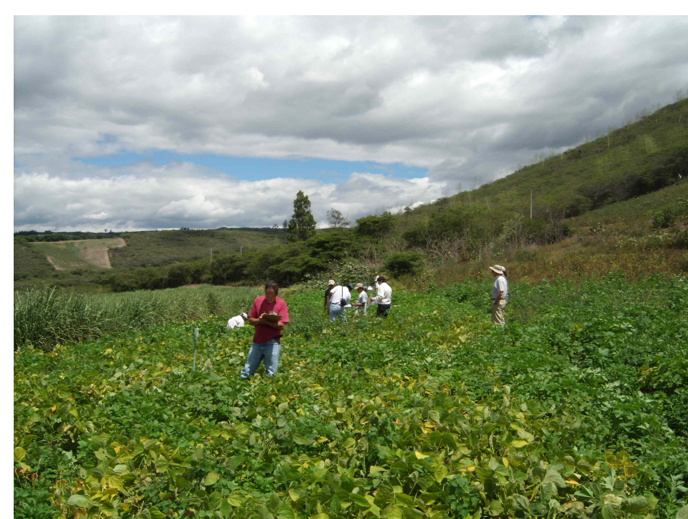
Fig. 2 Severe damage by Fusarium -wilt to beans in Ecuador